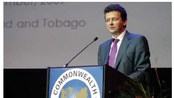
Anthony Hayward, Former Group CEO, BP Plc at Commonwealth Business Forum 2009