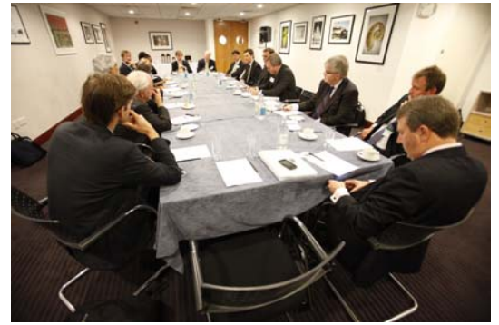
Discussions at ABF 2011

The Namibia project workbook will be launched at the Namibia Investment Forum featuring a project portfolio of investment proposals that are looking for funding and business partners in the region. Networking opportunities at the Forum will enable participants to meet with potential investors and partners in key sectors such as tourism, infrastructure, agriculture, mining and manufacturing.