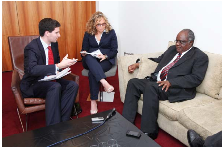
H.E. Hifikepunye Pohamba being interviewed by CBC Editorial team for Namibia Investment Guide

The Guide will allow the investment strategy and message to reach a wider audience and will be distributed amongst CBC events throughout 2012. The guide allows business and government to articulate their experiences of working within the economy, and present a balanced overview of the investment opportunities across Namibia.