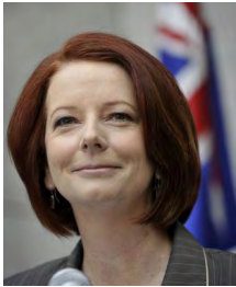
Hon Julia Gillard MP, Prime Minister of Australia & Chair in Office of the Commonwealth

"The nations and peoples of the Commonwealth are enormously diverse, yet these values we share, our distinctive way of doing things and our distinctive set of concerns for the world's people, unite us in a way that is truly wonderful ... Our friends in the Business Council call it the "Commonwealth factor", the web of connections, friendships and values that drive opportunity among the 54 nations of our fellowship."