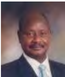
HE Yoweri Museveni President of the Republic of Uganda

"I appreciate the unwavering support received from CBC during Rwanda's application to join the Commonwealth. Now that Rwanda is a formal member, we look forward to an even stronger partnership to promote business and investment not only in our country, but in Africa as a whole."