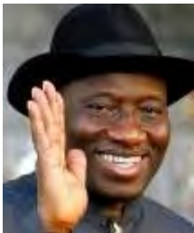
HE Goodluck Jonathan President of the Federal Republic of Nigeria

"The Commonwealth Business Council is to be commended, for their continued efforts on bridging the economic divide in the commonwealth and beyond, through the promotion of private investment and trade opportunities. "