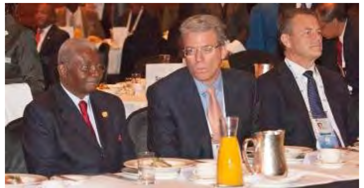
HE Armando Guebuza, President of Mozambique, Tom Albanese, CEO, Rio Tinto, Carl Henric Svanberg, Chairman, BP Group at the Commonwealth Business Forum