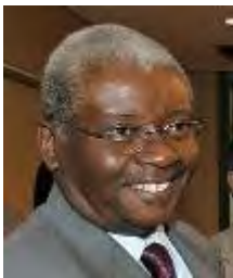
HE Armando Guebuza, President of the Republic of Mozambique

"My country is grateful to the Commonwealth Business Council for creating opportunities for partnerships, and linkages between African countries, and the international business community."