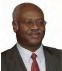
HE Philemon Yang Prime Minister of the Republic of Cameroon

"The nations and peoples of the Commonwealth are enormously diverse, yet these values we share, our distinctive way of doing things and our distinctive set of concerns for the world's people, unite us in a way that is truly wonderful ... Our friends in the Business Council call it the "Commonwealth factor", the web of connections, friendships and values that drive opportunity among the 54 nations of our fellowship."