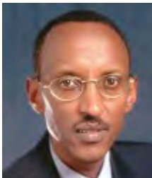
HE Paul Kagame President of the Republic of Rwanda

"It is important to encourage development through trade and investment, rather than aid. The Commonwealth's unique mix of highly developed and developing countries creates a valuable network, supported by the Commonwealth Business Council."