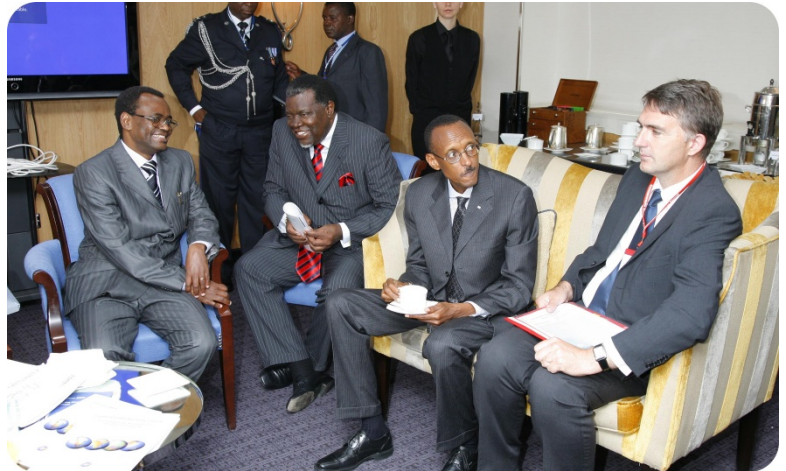
Hon. George Kunda, Vice President Republic of Zambia, Hon. Dr Hage Geingob, Minister of Trade & Industry, Republic of Namibia, HE Paul Kagame, President Republic of Rwanda, Mike Foster MP, Parliamentary Under Secretary of State, DFID, UK