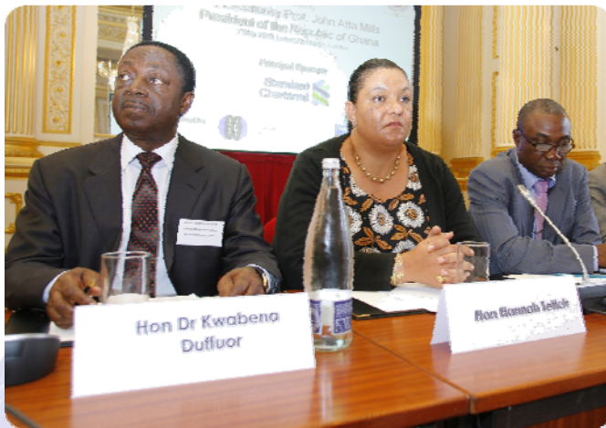
Hon Dr Kwabena Duffuor, Minister of Finance, Hon Hannah Tetteh, Minister of Trade & Industry, Hon Dr Kwabena Donkor, Deputy Energy Minister at the Investment Forum in London

Register today at: aif2010.eventbrite.com