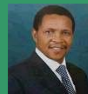
HE Jakaya Kikwete President of the United Republic of Tanzania

"The current global economic environment has increased the importance of trade and investment as key pillars of economic success. Indeed, no country can hope to achieve sustainable economic growth without expanding and diversifying trade with its neighbours, and the rest of the world."