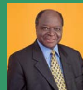
HE Hon Mwai Kibaki President of The Republic of Kenya

"The current global economic environment has increased the importance of trade and investment as key pillars of economic success. Indeed, no country can hope to achieve sustainable economic growth without expanding and diversifying trade with its neighbours, and the rest of the world."