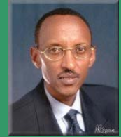
HE Paul Kagame President of the Republic of Rwanda

"The Commonwealth Business Council puts together impressive programmes that bring together business and government leaders to explore the ways of making emerging markets competitive in the Commonwealth and global economy."