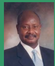
HE Yoweri Museveni President of the Republic of Uganda

"The Commonwealth Business Council puts together impressive programmes that bring together business and government leaders to explore the ways of making emerging markets competitive in the Commonwealth and global economy."