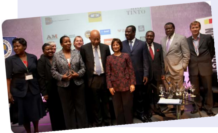
Launch of the Business Action Against Corruption Initiative at the Africa Business Forum 2008